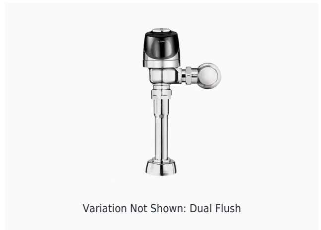
Variation Not Shown: Dual Flush